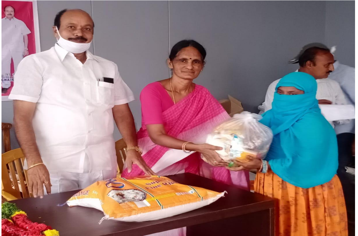
Chairman and correspondent had donated basic groceries to Private Teachers & Journalists