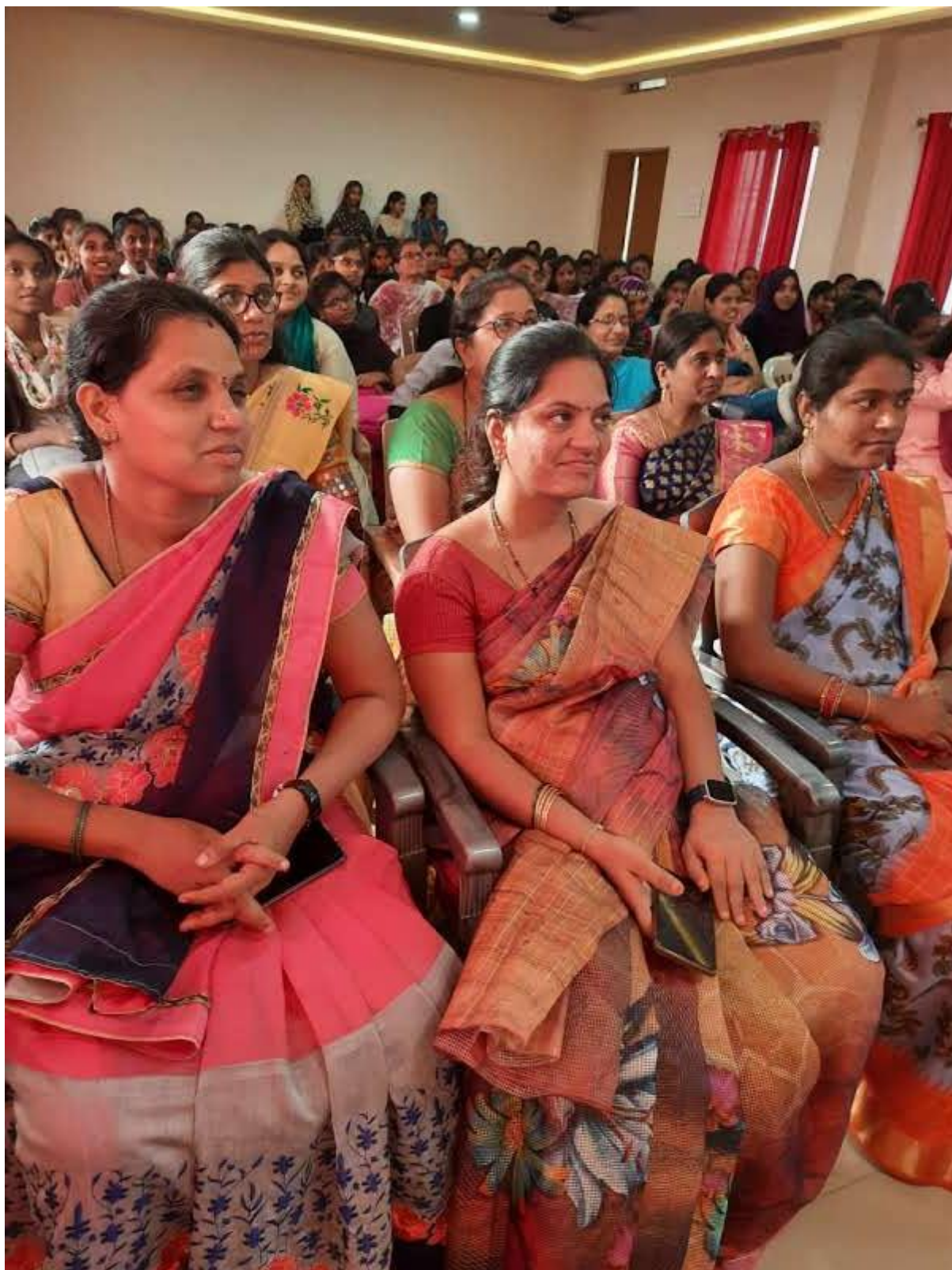
Women Faculty and Girl students during the Programme