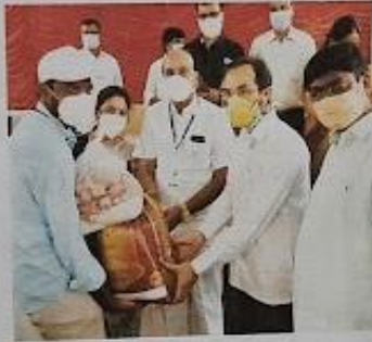
విద్యావేత్తల కుటుంబ సభ్యులకు ఎమ్మెల్యే