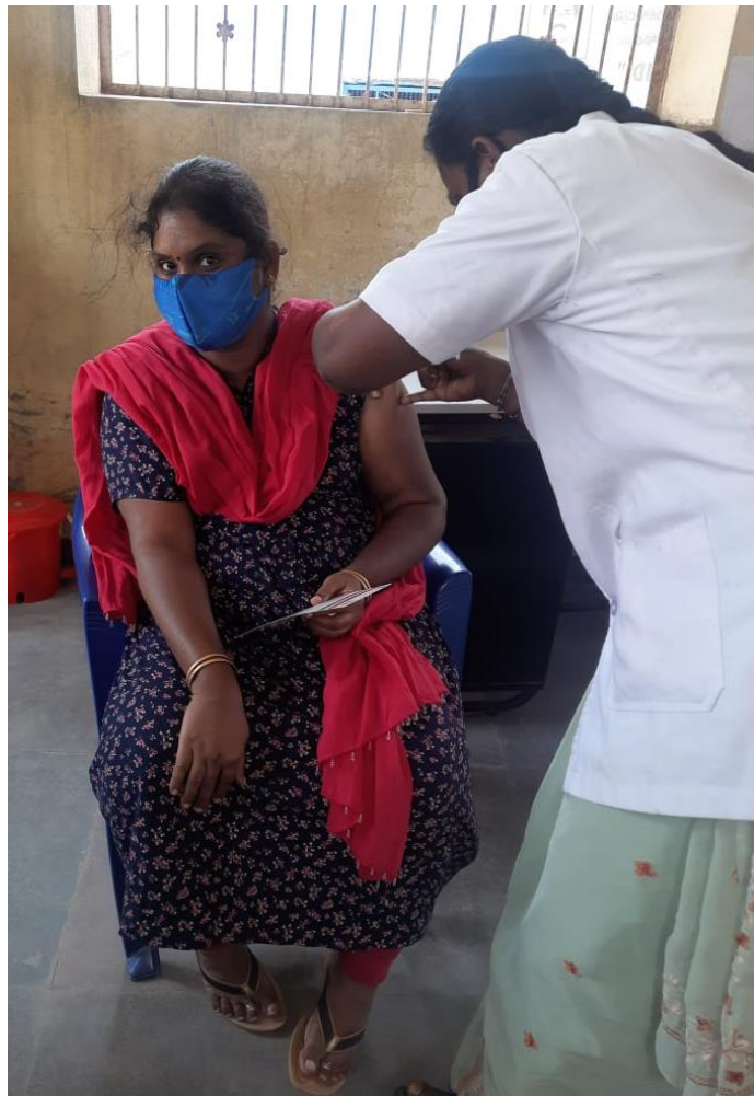
Faculty taken 2 nd dose vaccination

As the world has observed a bitter experience during COVID-19 and its consequences, the college has taken an initiative step to vaccinate all the eligible college students on the campus premises. Around 500 students of the college got vaccinated with first and second doses. All the teaching and non-teaching staff also availed this facility of vaccination during the VACCINATION programme conducted by the college.